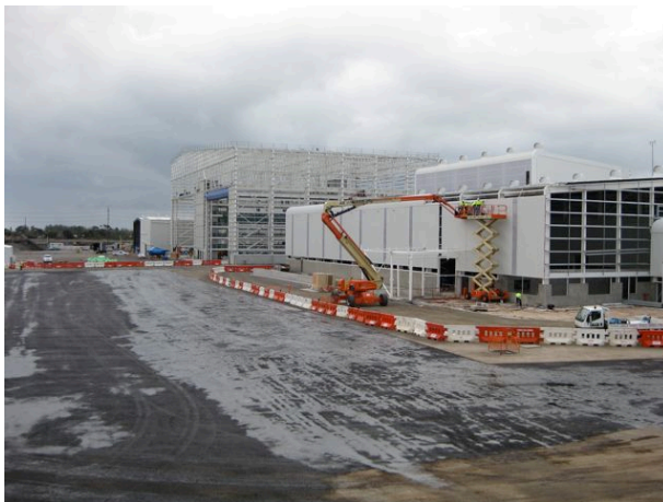
Warehouse and Pre-out Building