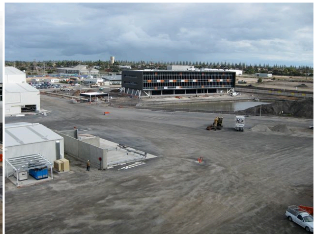
Administration and Tank Farm