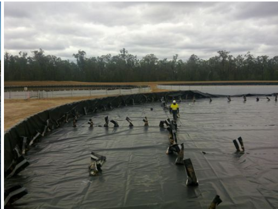
Origin Tanks (QLD)