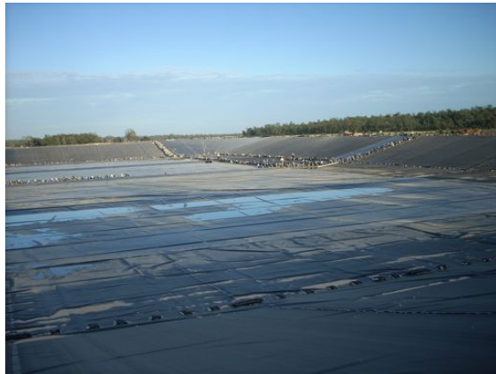
Zig-Zag Evaporation Pond (QLD)

Fabtech supply and install various liners/membranes/geotextiles, for dams, evaporation tanks and landfills through-out Australia. ARKPM has continued its role providing project management support services, over-seeing the completion of the first prototype evaporation tanks and recent completion of a large evaporation pond at project Zig-Zag. These works have been undertaken to support exploration of the Coal Seam gas projects, in and around Roma (QLD).